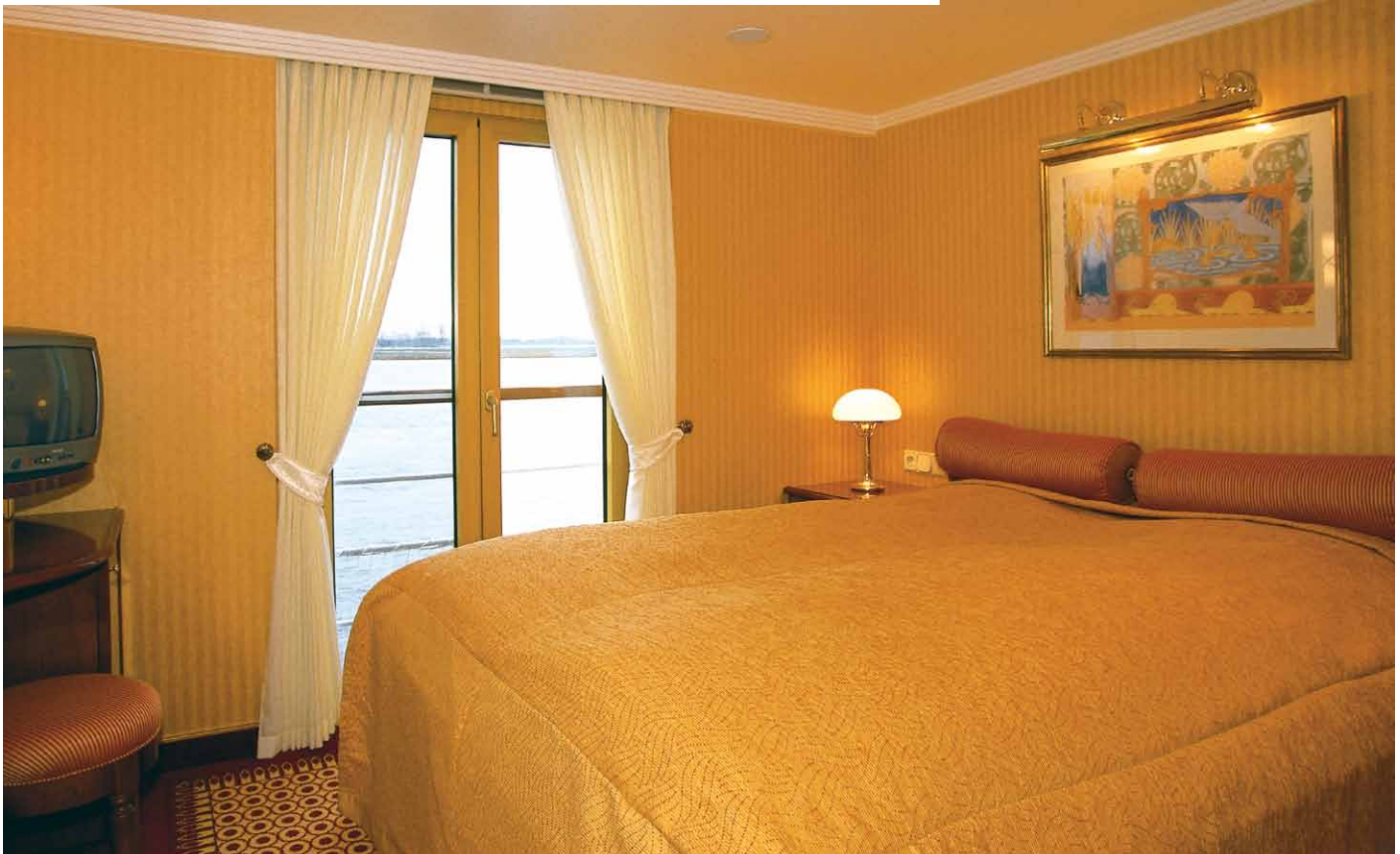
A typical 2-bed Upper Deck cabin