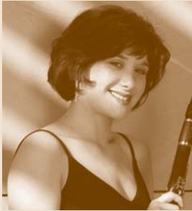
SHARON KAM Clarinet

Voyage 298 September 18 - October 1, 2008